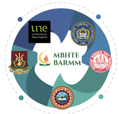
Figure 1. Consortium of Institutions

A consortium in support of the project (Figure 1) was established among UNE in Australia, PNU in Manila, and three teacher education institutions (TEIs) in Mindanao, namely, Western Mindanao State University (WMSU) in Zamboanga City, Mindanao State University (MSU) in Marawi City, and Cotabato State University (CSU) in Cotabato City.